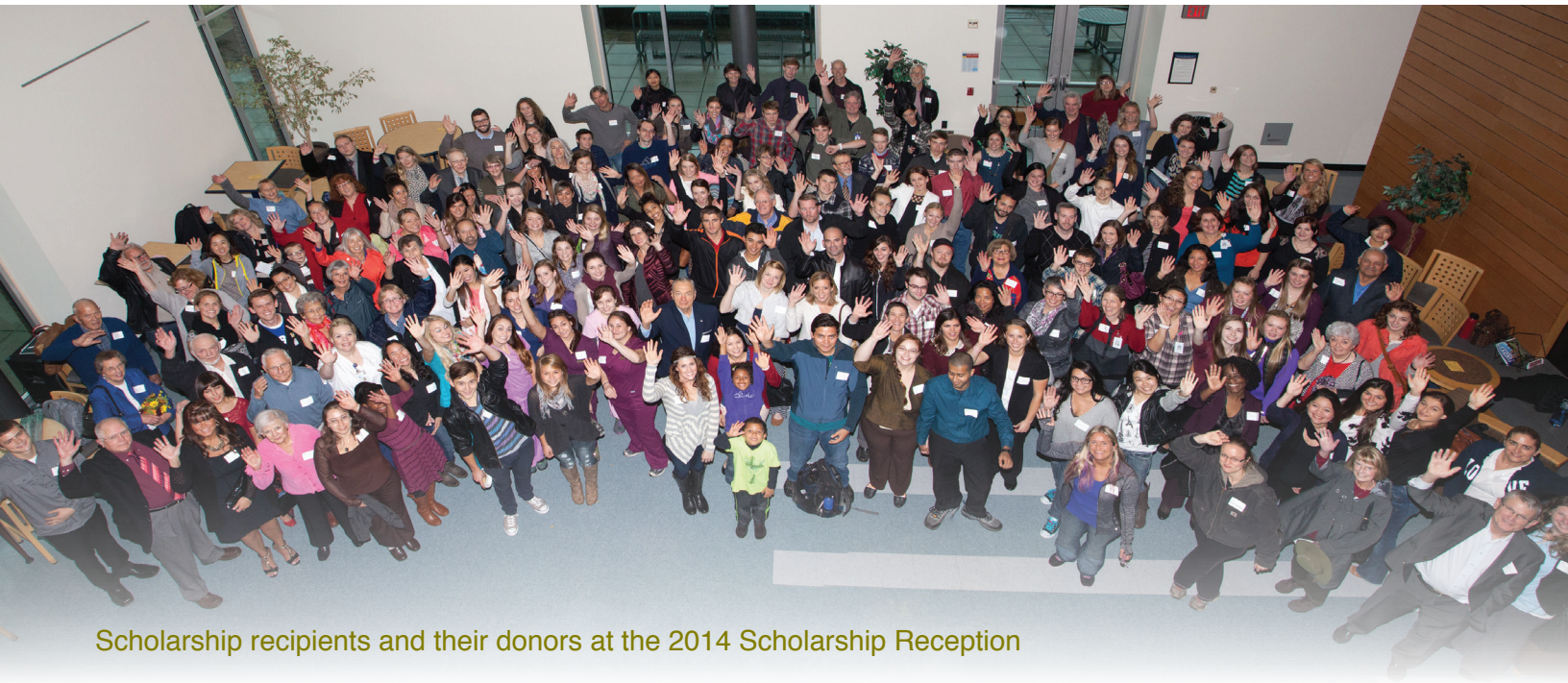
Scholarship recipients and their donors at the 2014 Scholarship Reception